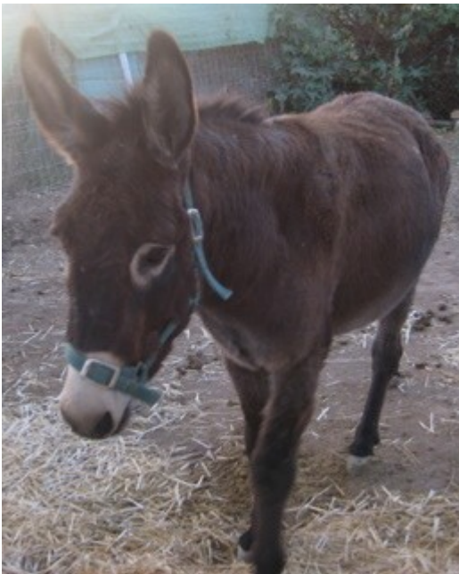
Branston and Feliz

Here's Branston and Feliz shortly after arriving at the sanctuary