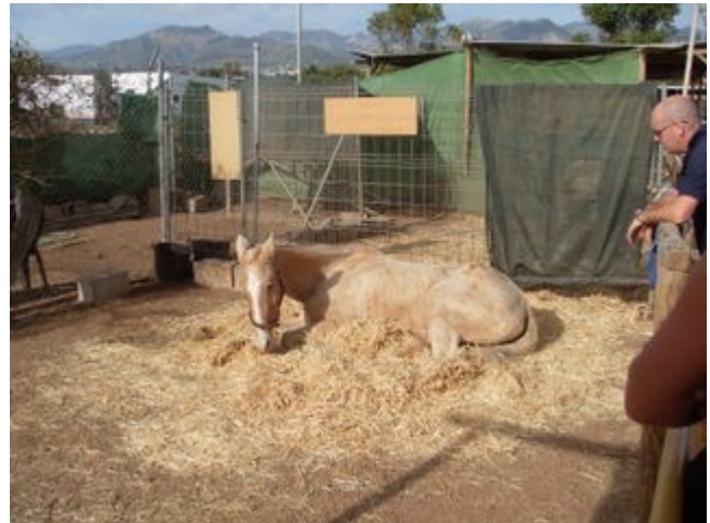
Rubia tired but safely in the sanctuary